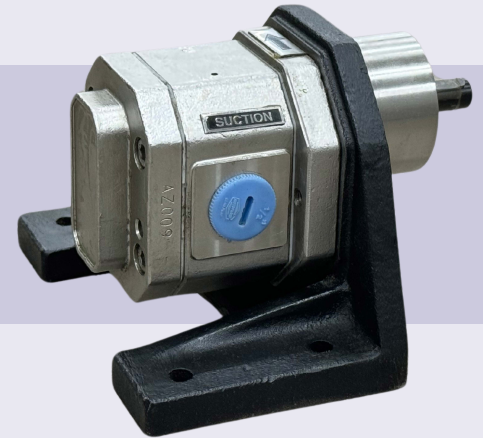
MODEL: SSX 075