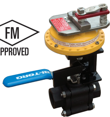
assembly shown with red safety link installed